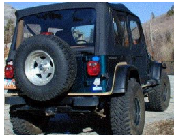
Jeep-type Utility Vehicles & Vehicles with removable Tops