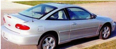
Rear Window without Obstruction

Vehicles legally parked, with driver's side toward the curb.