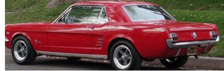
Rear Window with obstruction (louvers, etc..)