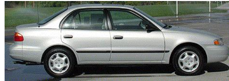
Rear Window with obstruction